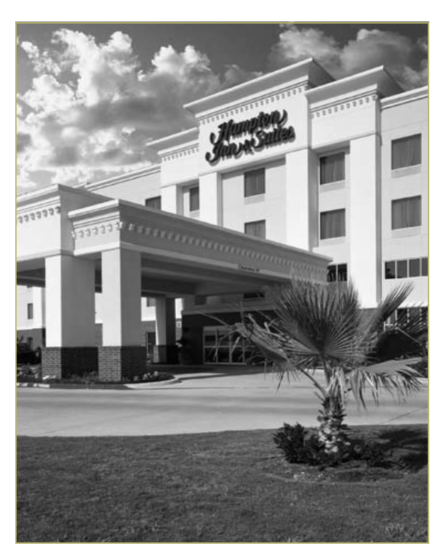
Funding for this event is provided in part by the City of Greenville Hotel/Motel Occupancy Tax Revenues.